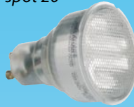
Energy saving lamp 7 W, lamp holder GU10, 230 V, Wide beam