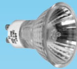
Halogen 35 W lamp holder GU10, 230 V, spot 30°